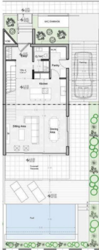
VILLA 4 - GROUND FLOOR