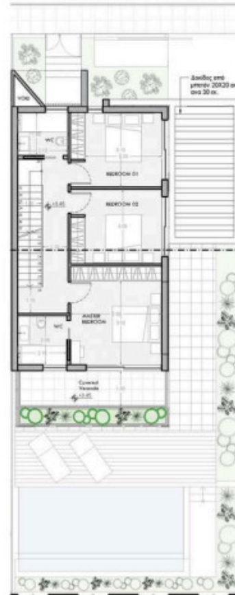
VILLA 4 - FIRST FLOOR